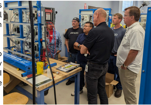
Company officials take a tour of the industrial maintenance lab at the Jackson County Learning Center in Seymour.

It was Nov. 9, 2023, that a ribbon-cutting ceremony was held in Seymour to mark the opening of electrical and mechanical training classes being offered by Vincennes. The training was made possible by the state of Indiana’s READI grant program and the support of area manufacturing companies and the Seymour Redevelopment Commission (RDC).