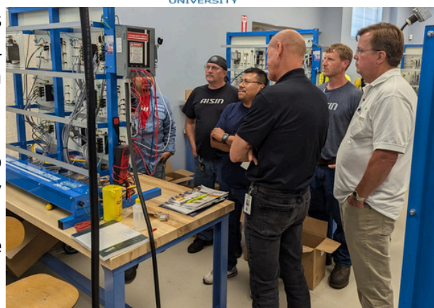
Company officials take a tour of the industrial maintenance lab at the Jackson County Learning Center in Seymour.

It is hoped that additional courses will be added as part of the state of Indiana's READI 2.0 grant program. That would follow the initial READI program funding from 2022 when $450,000 was granted to support the training. The Seymour RDC matched those funds with additional funding coming from the Aisin companies of Jackson County, Valeo and Cummins. Under READI 2.0, advanced classes for mechanical and electrical maintenance are among the requested programs seeking funding from the South Central Indiana Talent Region's application.